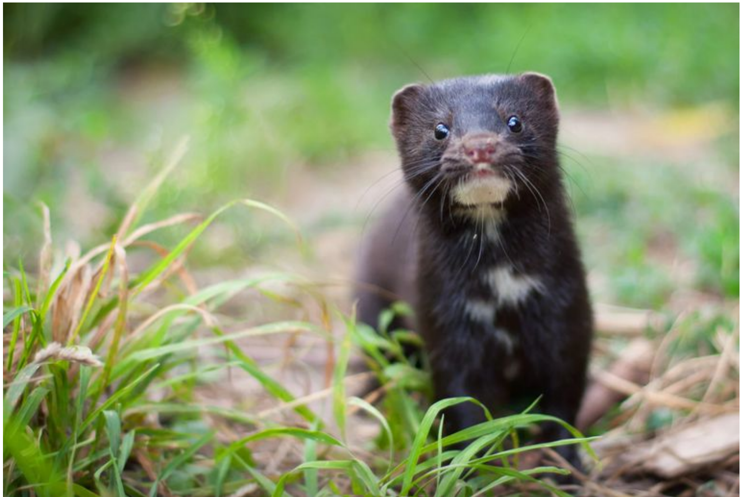
A wild American mink.